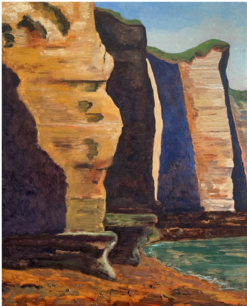
Guy de Malherbe, Falaises , oil on canvas, 89 x 65 cm, 2025