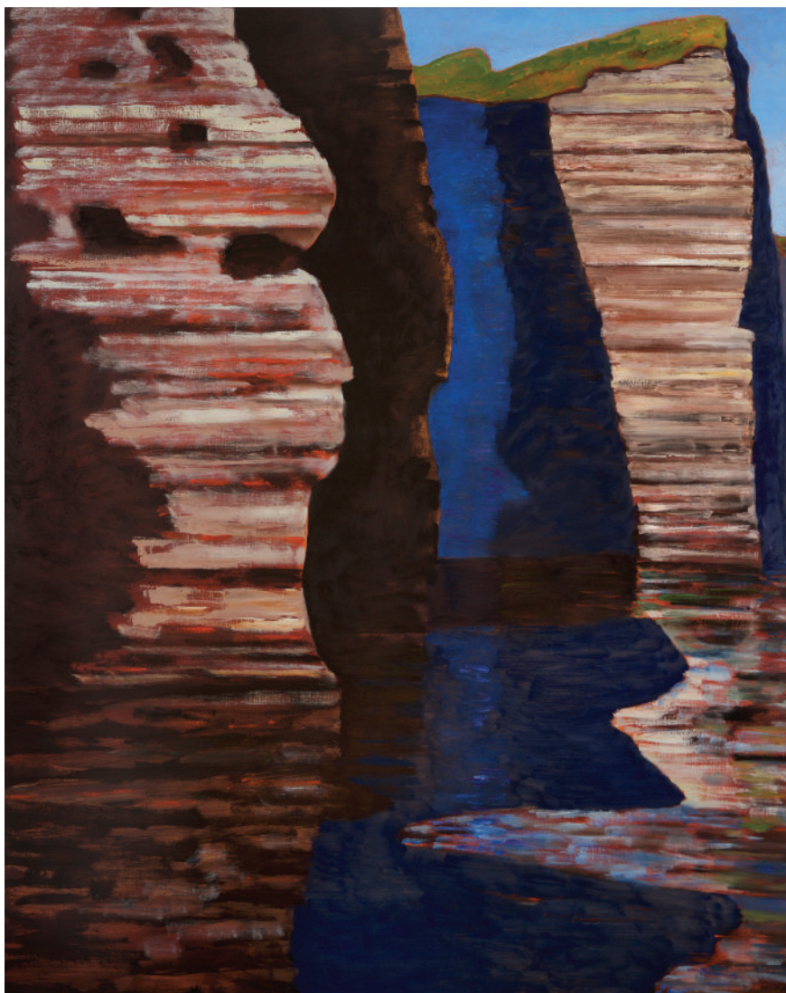
Guy de Malherbe, Falaises , oil on canvas, 114 x 146 cm, 2025, © Bertrand Michau