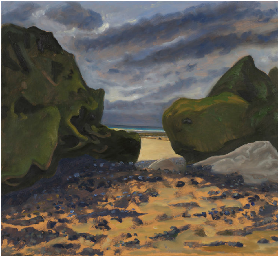
Guy de Malherbe, Sur le motif, Varengeville , oil on canvas, 40 x 40 cm, 2024