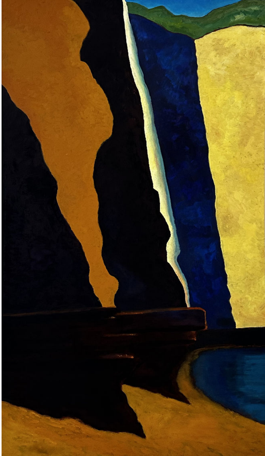
Guy de Malherbe, Fractures, ombres et lumières , oil on canvas, 195 x 97 cm, 2025