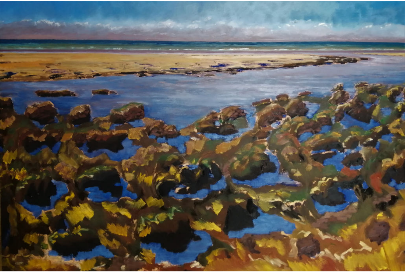
Guy de Malherbe, Marée basse I , oil on canvas, 130 x 195 cm, 2019