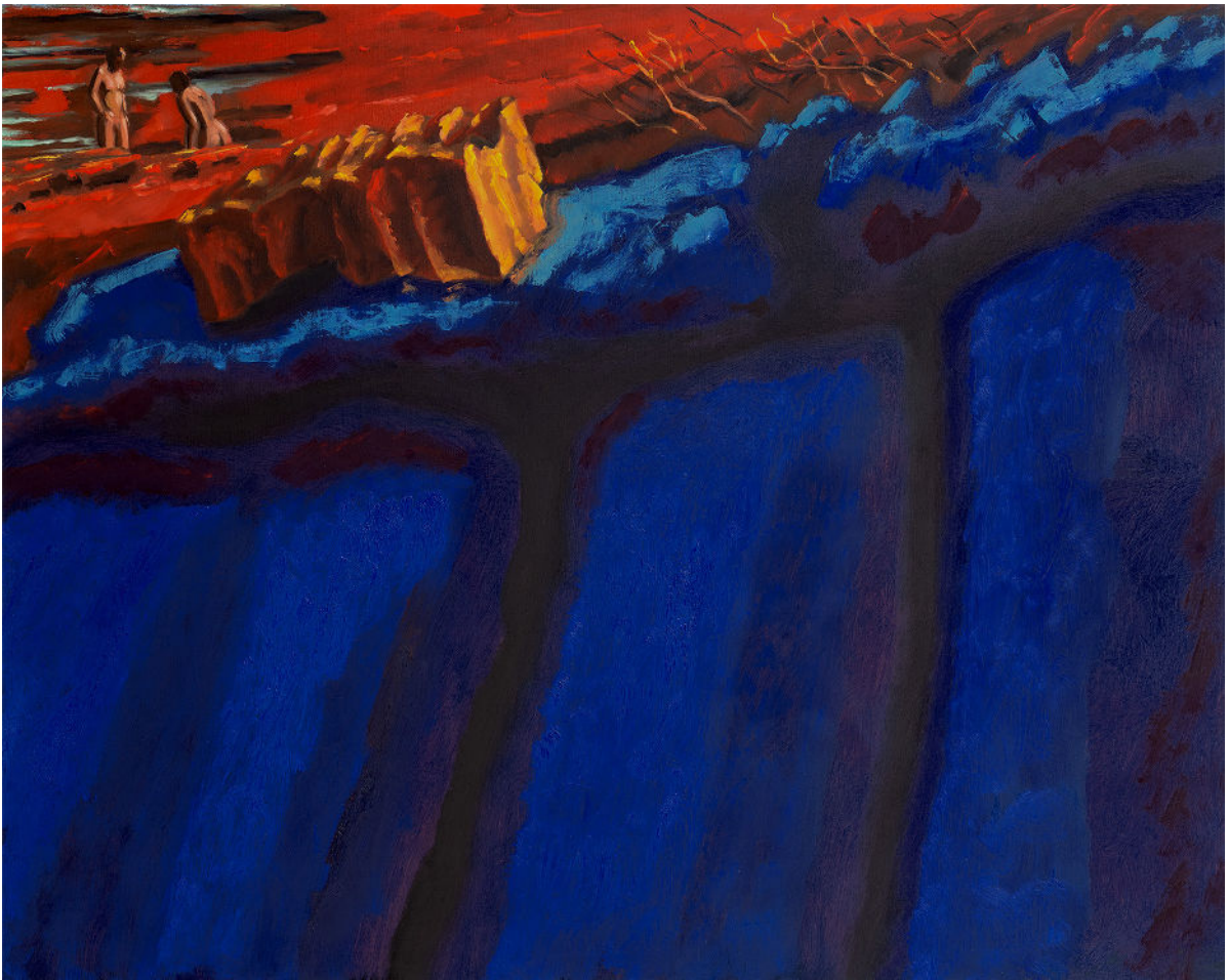
Guy de Malherbe, Rivages , oil on canvas, 65 x 81 cm, 2025