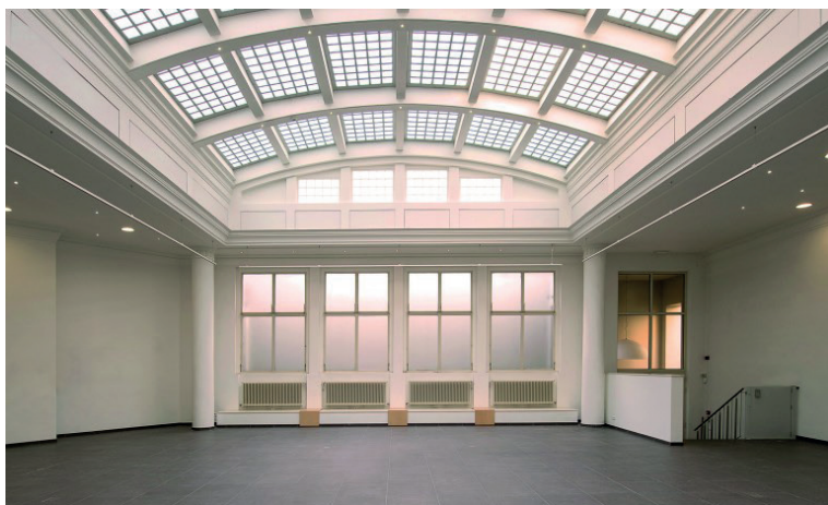
Galerie La Forest Divonne Bruxelles An exceptional Art Deco glass roof in the creative and trendy Saint-Gilles district

Galerie La Forest Divonne has two locations: one in Paris' iconic Saint-Germain-des-Prés, since 1988, and an other one in Brussels since 2016, under the glass-ceiling of a national heritage Art Nouveau Building.