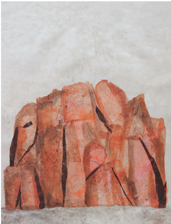
Valérie Novello, Recoller Montagne rose , Japanese paper, pastel, glass H 120 x L 96 cm, 2019