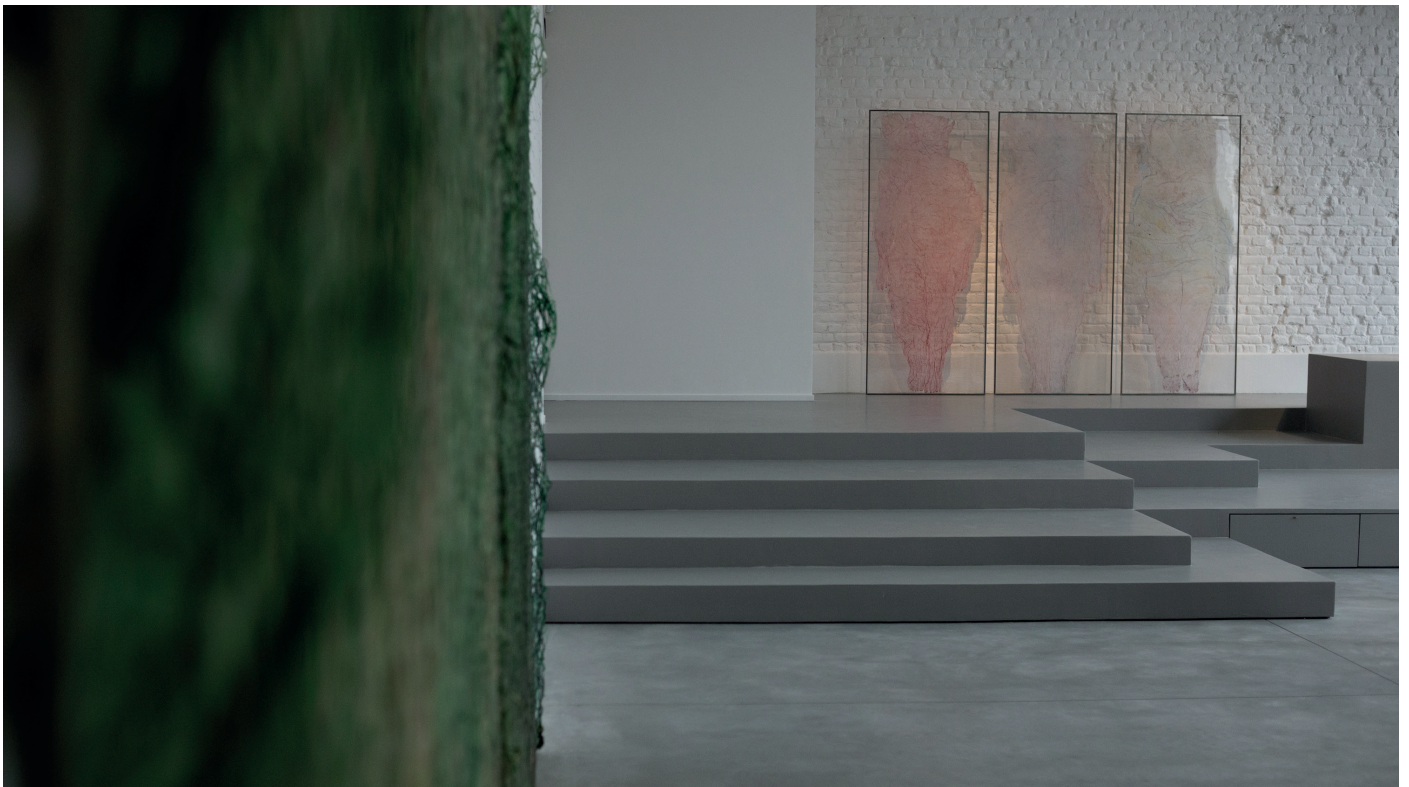
Valérie Novello Peaux and Recouvrement © Caroline Dejonghe

Registration link: https://www.eventbrite.com/e/inner-lands-scapes-tickets-851541021117?aff=oddtcreator