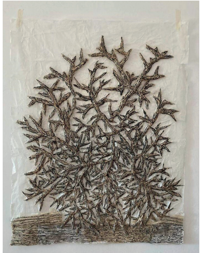
Valérie Novello, Epines , Japanese paper, pastel, glass, 94 x 119 cm, 2021