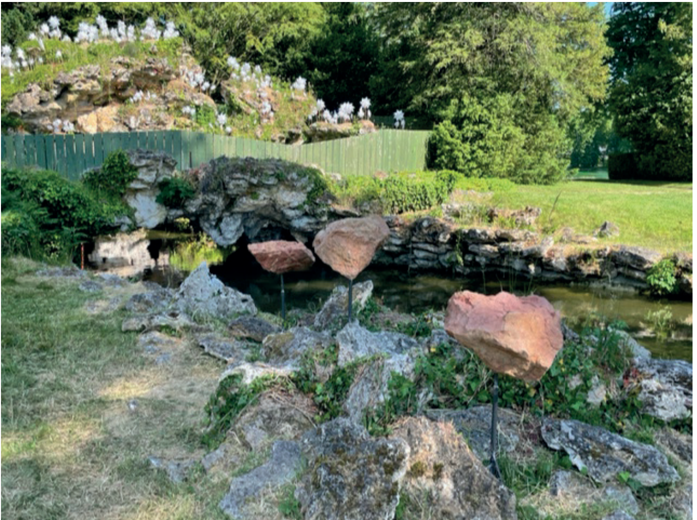
Gerard Kuijpers, Group of 3 stones from South Pyrenees, at exhibition Grandeur Nature , Château de Fontainebleau

Design Museum Gent, Gent, Belgium Deutsches Architektur Museum, Frankfurt , Germany