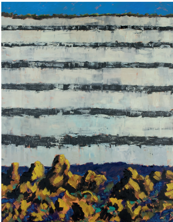
Guy de Malherbe, Falaise , Oil on canvas, 250 x 195 cm, 2013