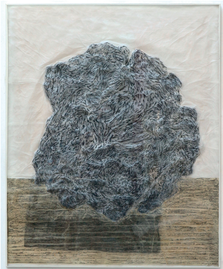
Valérie Novello, Boule , Japanese paper, dry pastel, 120 x 93 cm, 2021