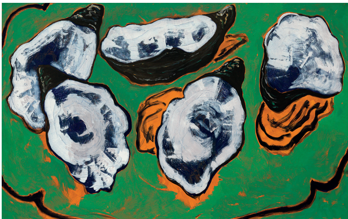
Guy de Malherbe, Cinq huîtres fond vert, orange et arabesque noir , oil on canvas, 99,5 x 159 cm, 2020