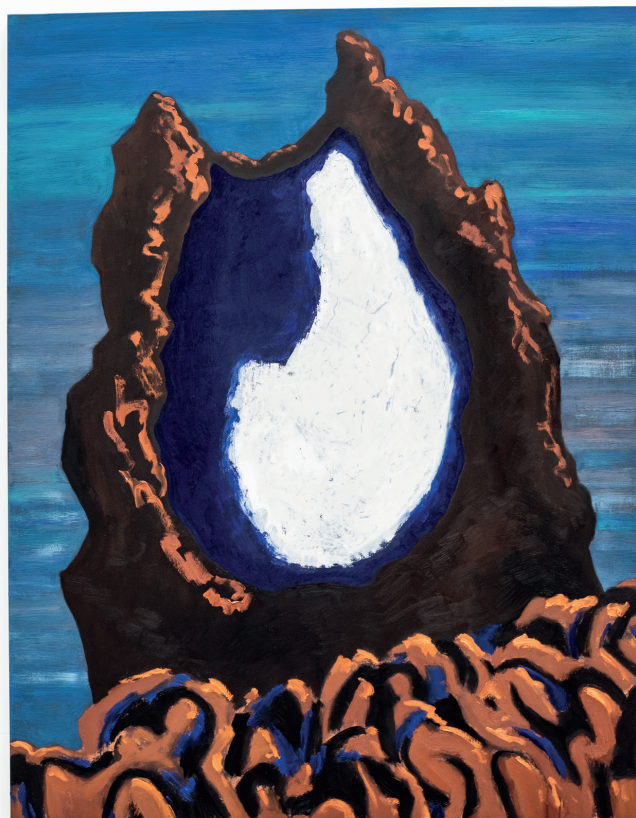
Guy de Malherbe, Sans titre , Oil on canvas, 146 x 114 cm, 2023