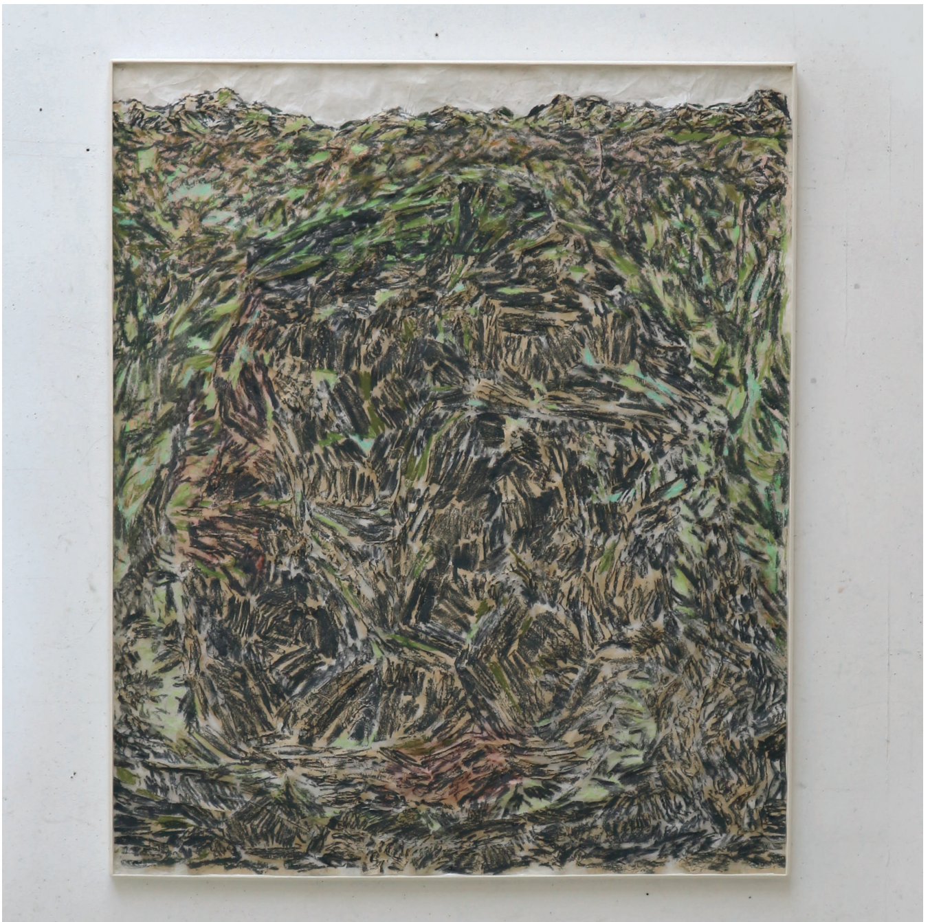
Valérie Novello, Untitled , Japanese paper, Nepal paper, pastel, 109 x 91 cm, 2024

«Quand le regard», by Valérie Brégaint, creative documentary film by Valérie Brégaint, 18 minutes. CNC. 2012