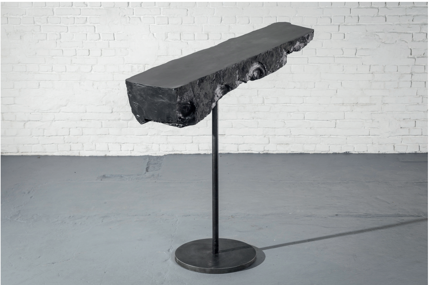
Gerard Kuijpers, Dancing Stone , Mazy black marble, 110 x 130 cm, 2024

Formerly represented by Galerie Gastou in Paris, Kuijpers' work has been included in major projects in France, Italy, Japan and the USA. Most recently with the Musée de la Chasse et de la Nature at the Château de Fontainebleau, in summer 2023, and in Milan, under the superb glass roof of the Galleria Vittorio Emanuele II. La Forest Divonne is proud to be exhibiting its work at Art Brussels 2024, following a first exhibition at BRAFA 2024.