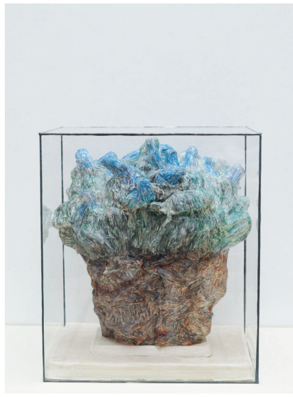
Valérie Novello, Oiseaux de jour , Japanese paper, gouache, glass bell, 59 x 42 x 42 cm, 2022