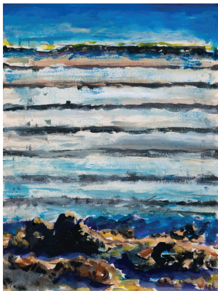
Guy de Malherbe, Untitled , mixed media on paper, 30 x 22 cm, 2014

Guy de Malherbe is a French artist, born in 1958. His work begins with painting «on the subject», in front of the landscape, the model or the objects that interest him. These on-the-subject sketches become the raw material for his studio work, in which he deploys a free, expressionist and sometimes pop gesture in drawing, gouache or oil.