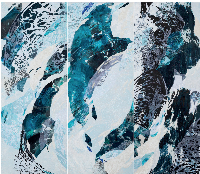
Caribai Migeot, L'Empreinte du vent VI , collage engraving and painting on three wooden panels, H 185 x L 222 cm, 2020