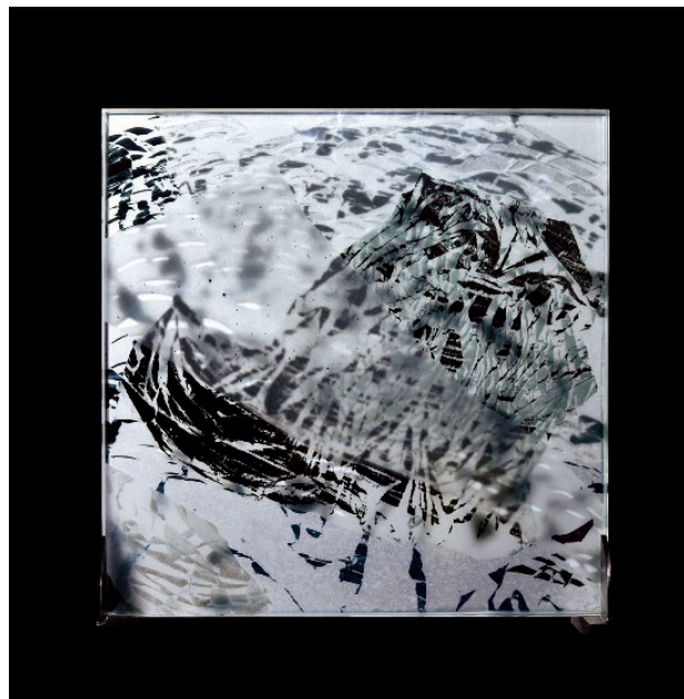
Caribai, Clairvoie VI , Ink on Japanese paper, laminated glass plates, steel stand, 50 x 50 x 3,5 cm, 2022

Mountain-water and wind-light: that's what the Chinese language calls landscape. Two complementary pairs, based on movement and emptiness, express a living nature in which the artist is more integrated than he is descriptive. Caribai, a French-Venezuelan artist, was born in Tokyo and lives in Brussels. The influence of Asia is very strong in her work, both in her approach to creation and in the materials she uses, Japanese paper in particular. Galerie La Forest Divonne is focusing on the work of this young artist, who has appropriated the Asian tradition to create a personal and contemporary practice, both in terms of rendering and technique. The impressive exhibition devoted to her by the Musée des Arts Asiatiques de Nice in 2021 gave the full measure of this powerful, ambitious and rich work, centered around a masterly polyptych over 30m long, installed in the museum's large rotunda like contemporary water lilies, and completed by an immersive installation of floating papers and papers under glass, bathed in light like the walls of traditional Japanese houses. The Art on Paper stand will showcase both her wood-mounted and glass-backed papers.