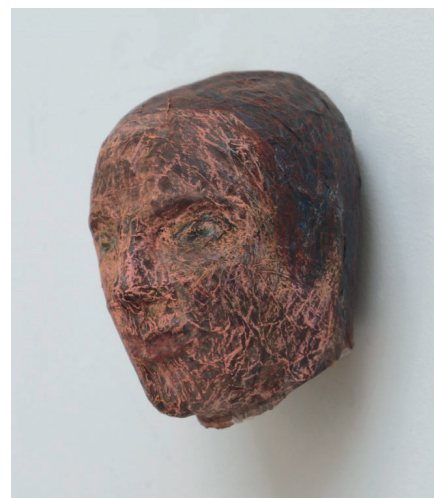
Valérie Novello, Tête dans la nuit , Japanese paper, pencil, pastel, 15 x 10 cm, 2020

Essentially graphic, Valérie Novello's work extends to the limits of drawing and sculpture, combining drawing and bas-relief techniques with the treatment of paper, and pushing the territory of drawing itself into the realms of glass, wax and plaster, through sometimes monumental works. Truly unclassifiable, her work is constructed like an archaeology of memories. «If everything cannot be explained, if everything cannot be reached, I try to give form to a mental image - distant and original - that obsesses me. I seek to approach it, to unveil it and reveal it in the present. All that remains of this original image are incomplete, broken up and fragmented», she writes.