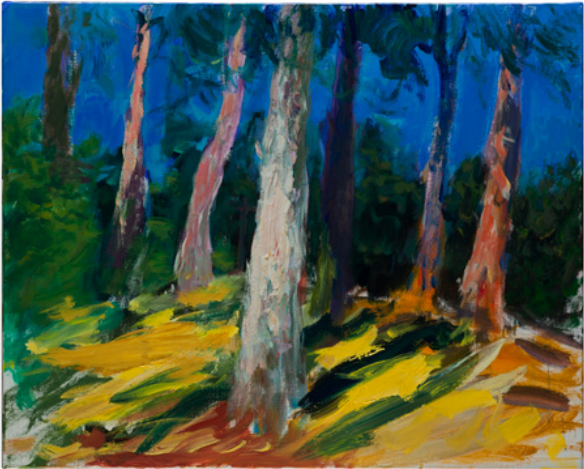
Patrice Giorda, Le mont Carmel , acrilic on canvas, 65 x 81 cm, 2023