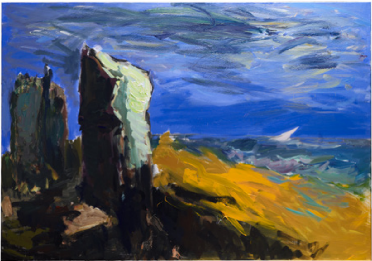
Patrice Giorda, Le Château des Hadleigh n°19 , acrilic on canvas, 114 x 162 cm, 2018