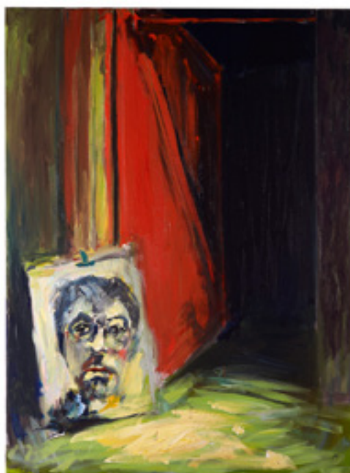
Patrice Giorda, La petite porte rouge , acrilic on canvas, 130 x 97 cm, 2016