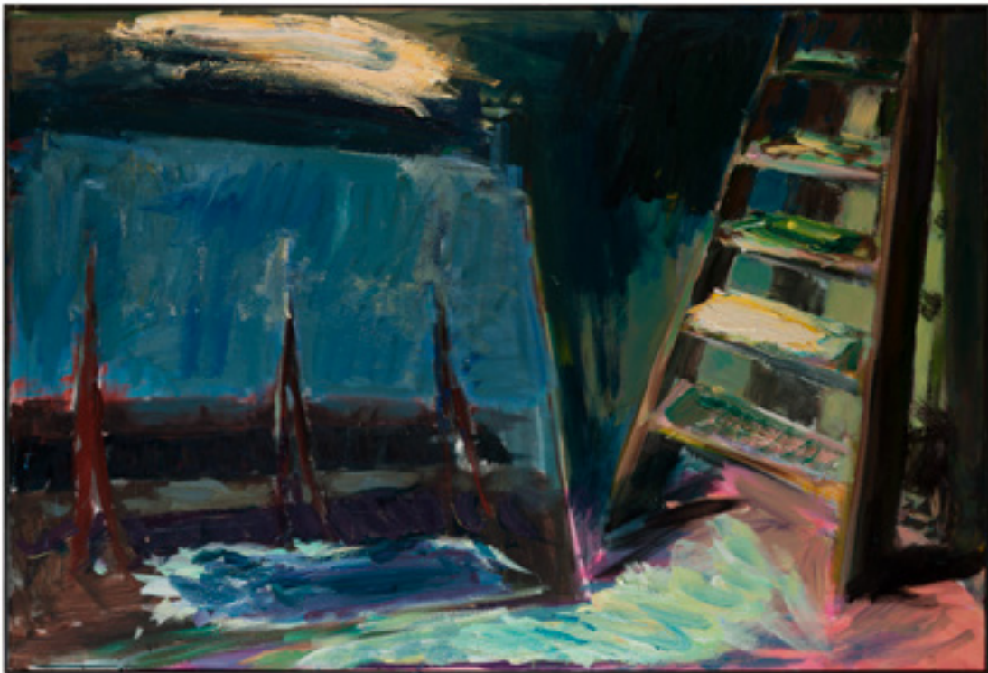
Patrice Giorda, Golgotha dans l'ateleir , acrilic on canvas, 97 x 130 cm, 2023

During the 2000s, Patrice Giorda painted many landscapes with a dense and compact touch: stormy seas, quiet villages or small watercolors more inspired by a trip to Quebec. One of the last important series is aptly titled «Le chantier Vélasquez» (2010-2011) and includes about fifty canvases that refer to an obsessive study of the Spanish master's painting. An ode to the genius of one of the most celebrated figures in the history of art and a personal attempt to appropriate its figures and motifs, this work seems to illustrate the essence of Patrice Giorda's work: a perpetual struggle to tame the medium and its history.