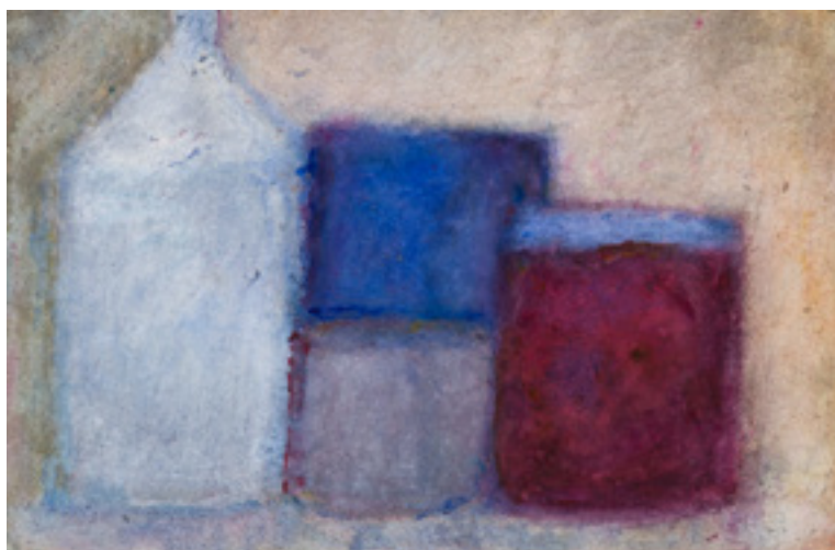
Alexandre Hollan, Still life , acrylic on paper, 70 x 90 cm, 2022