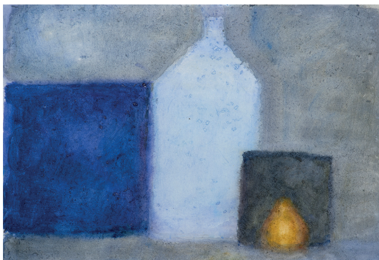
Alexandre Hollan, Still life , acrylic on paper, 70 x 90 cm, 2022