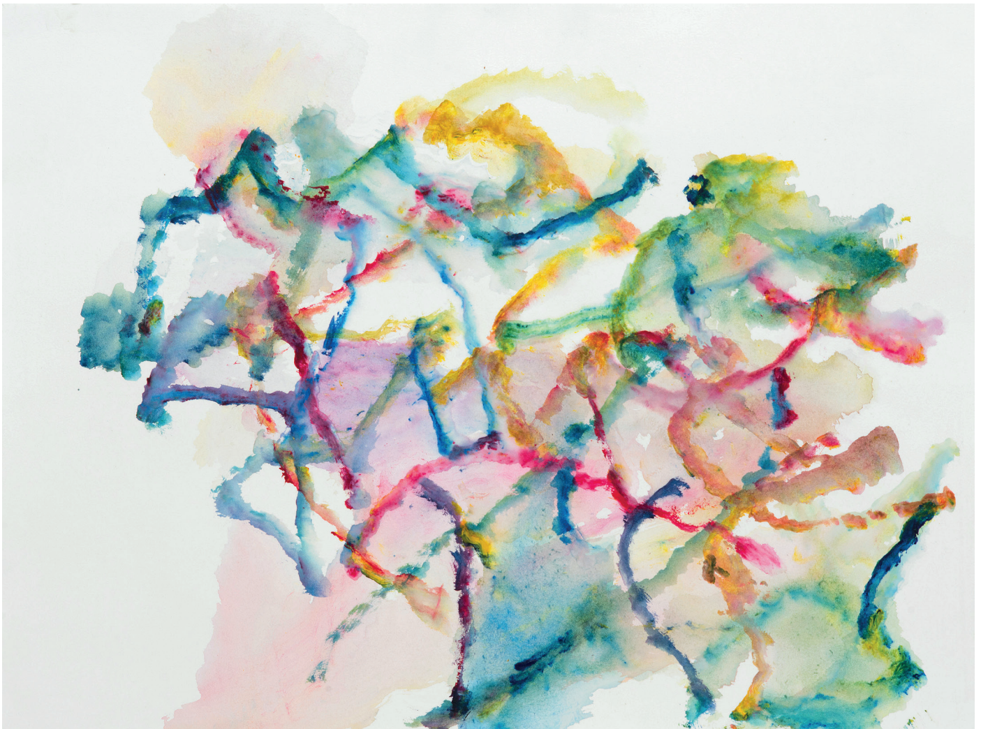
Alexandre Hollan, The Dancing Oak, rhythm of light , acrylic on paper, 56 x 76 cm, 2022