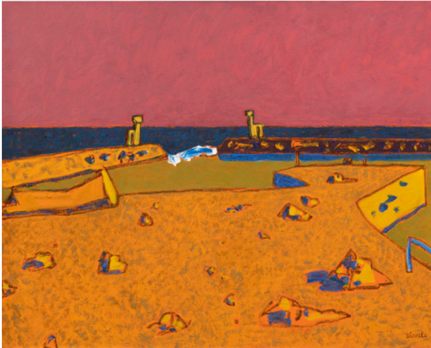
Vincent Bioulès Un Soir à Carnon

Oil on canvas, 73 x 92 cm/29 x 36 inch, 2021