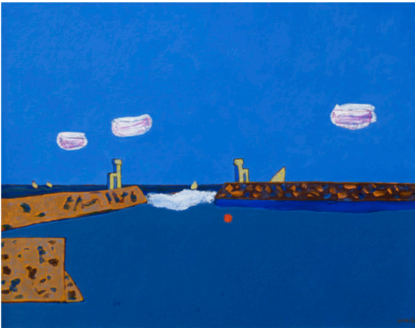
Vincent Bioulès Le Port de Carnon

Oil on canvas, 81x 100cm/32 x 39 inch, 2021