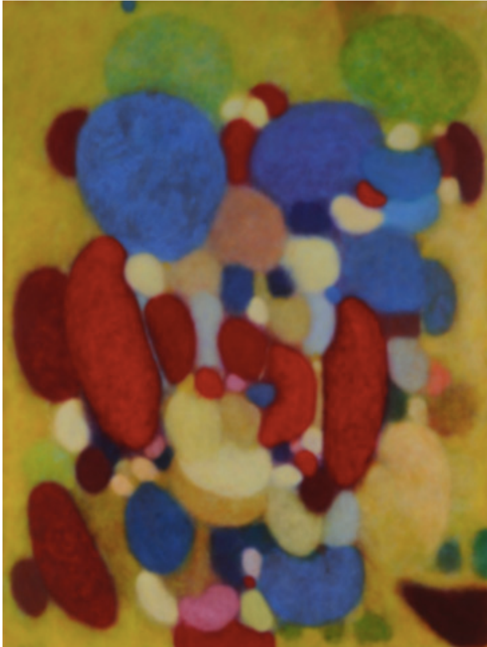
Jeff Kowatch Jumping through hoops

Oil on linen, 200 x 150 cm/79 x 59 inch, 2018