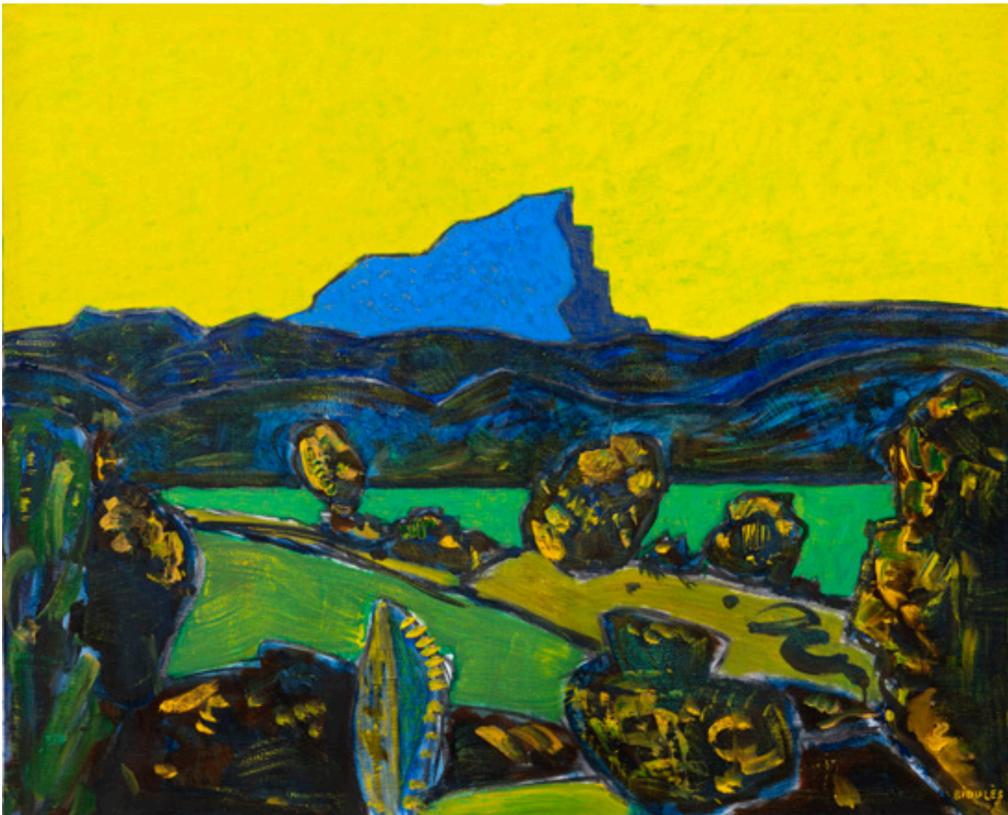
Vincent Bioulès Le Pic Saint Loup vu de Beaulieu

Oil on canvas, 73 x 92 cm/29 x 36 inch, 2021