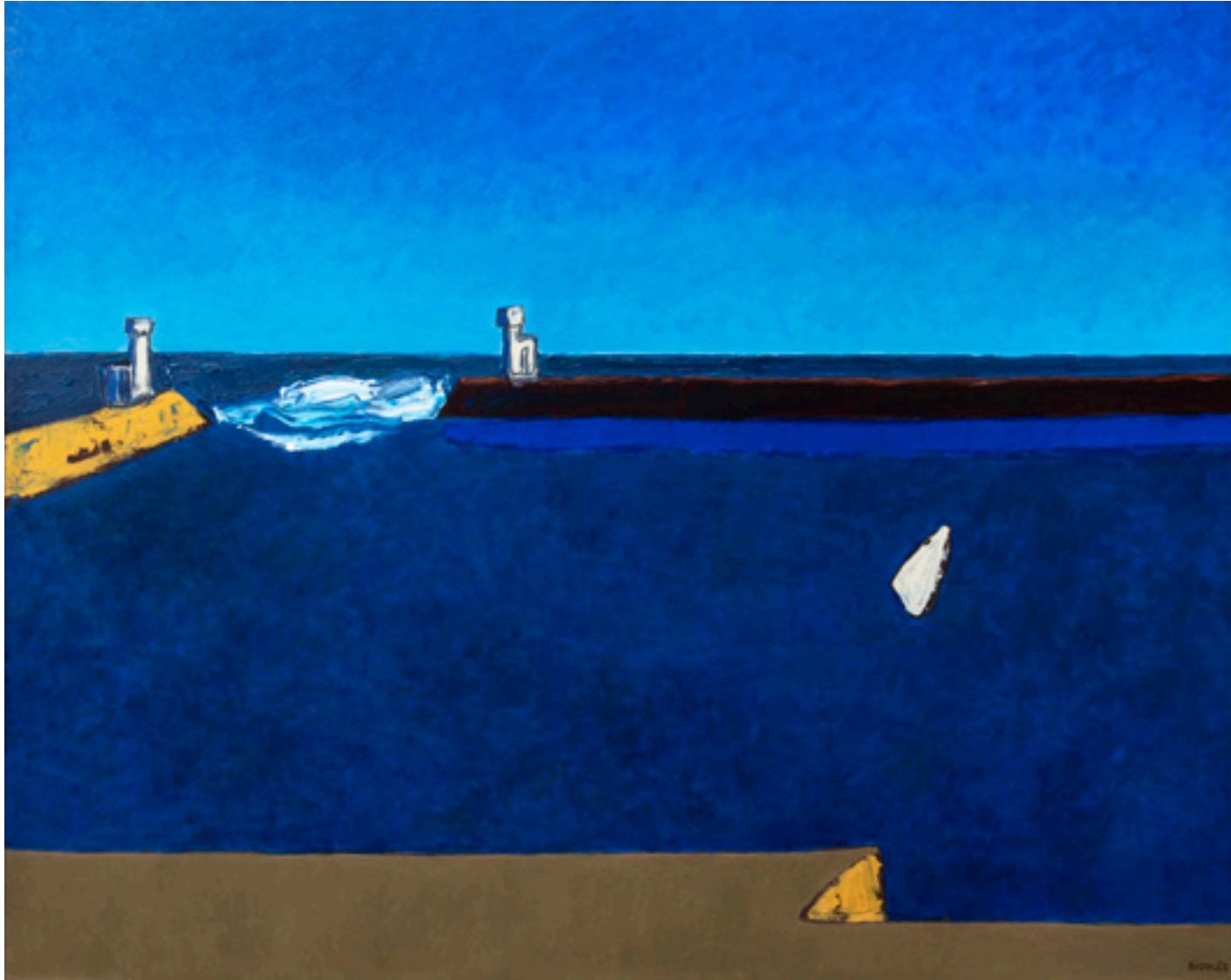
Vincent Bioulès Le Port de Carnon

Oil on canvas, 130x 162 cm/51 x 64 inch, 2021