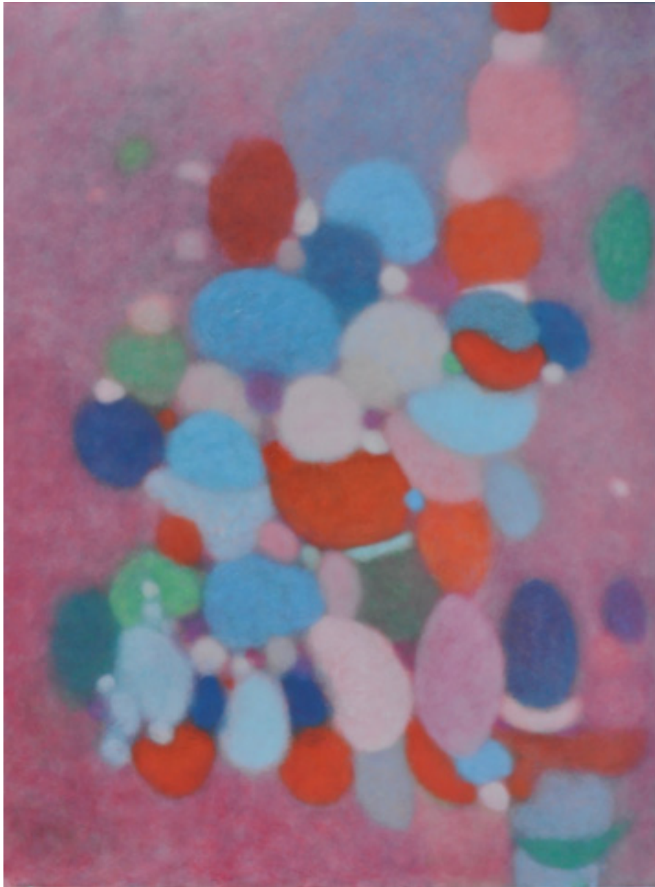
Jeff Kowatch Starway to the moon

Oil on linen, 200 x 150 cm/79 x 59 inch, 2018