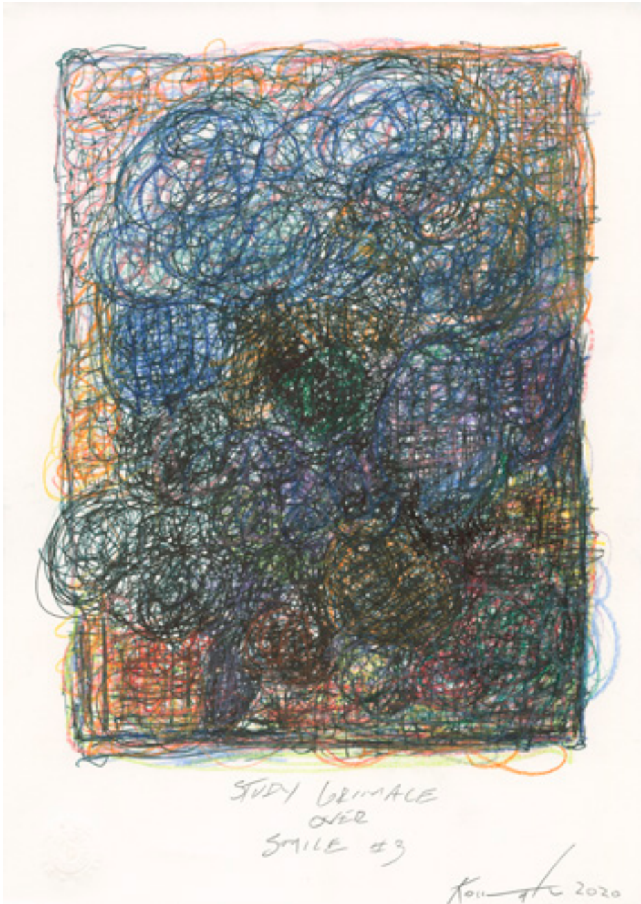
Jeff Kowatch Study grimace over smile #3

Ink and color pencil on paper, 29,7 x 21 cm/12 x 8 inch, 2021