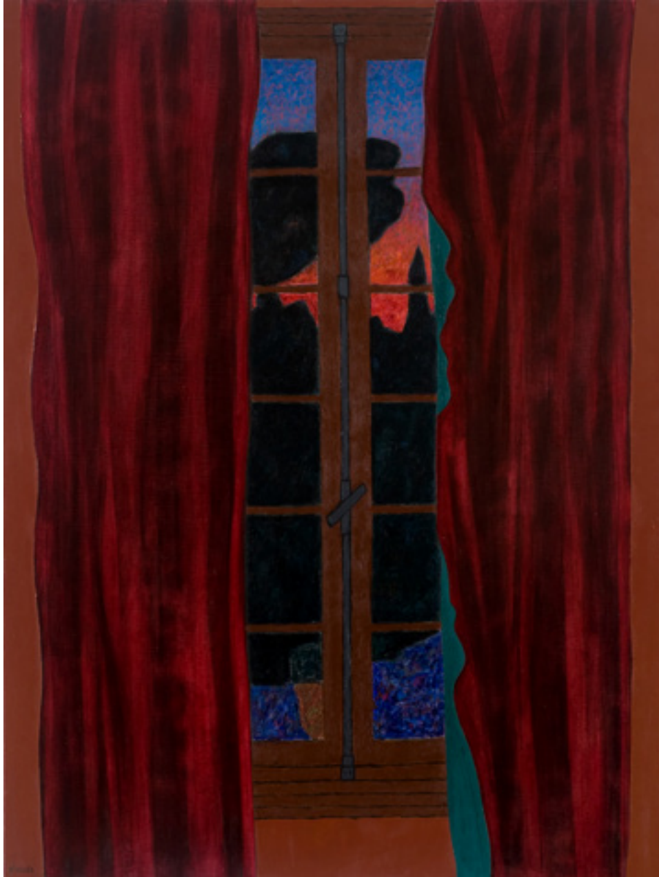
Vincent Bioulès Le Mois de janvier

Oil on canvas, 146 x 114 cm/57 x 45 inch, 2015