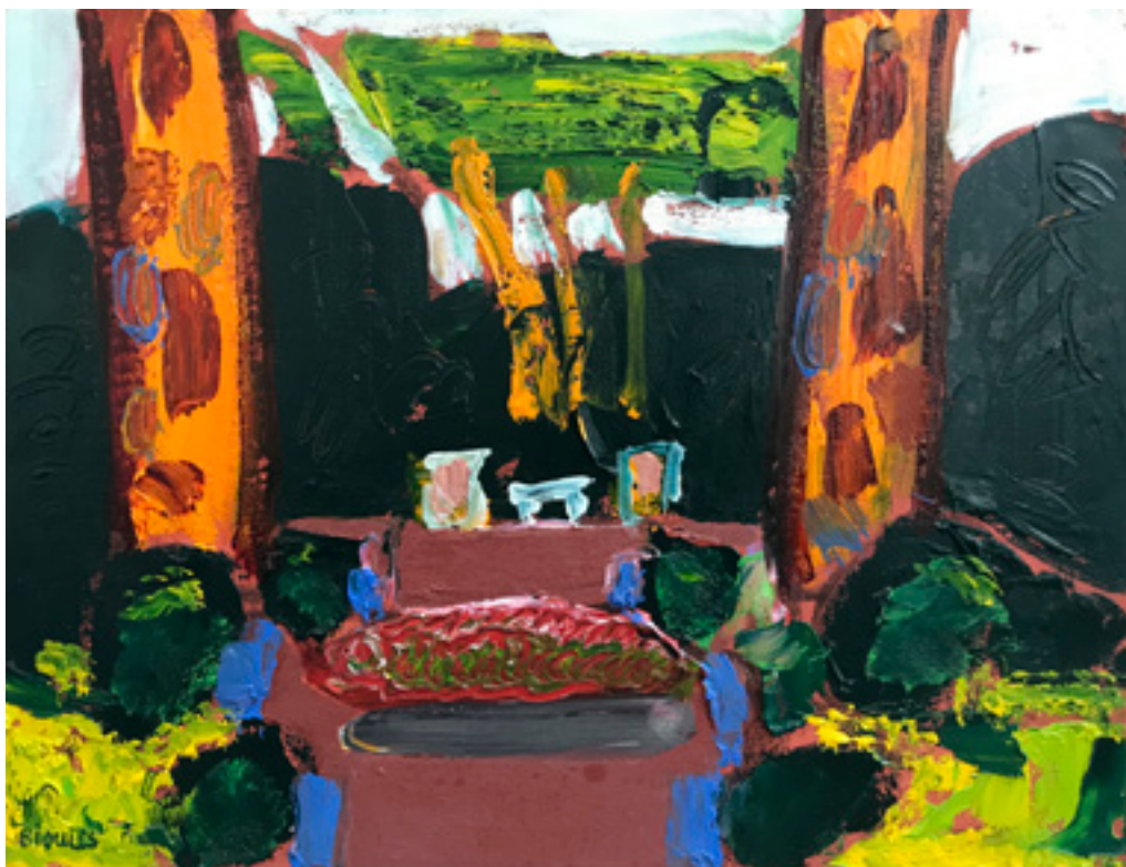
Vincent Bioulès Un Soir

Oil on canvas, 27 x 33 cm/11x 13 inch, 2021