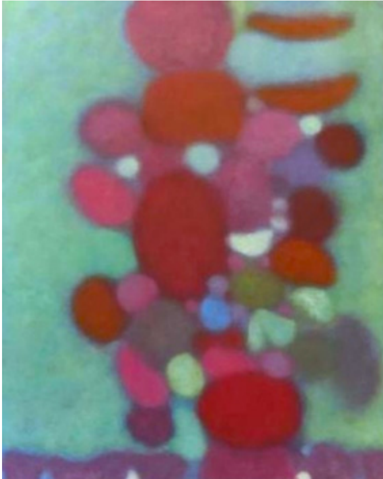
Jeff Kowatch Trip off the tongue

Oil on linen, 104 x 84 cm/41 x 33 inch, 2018