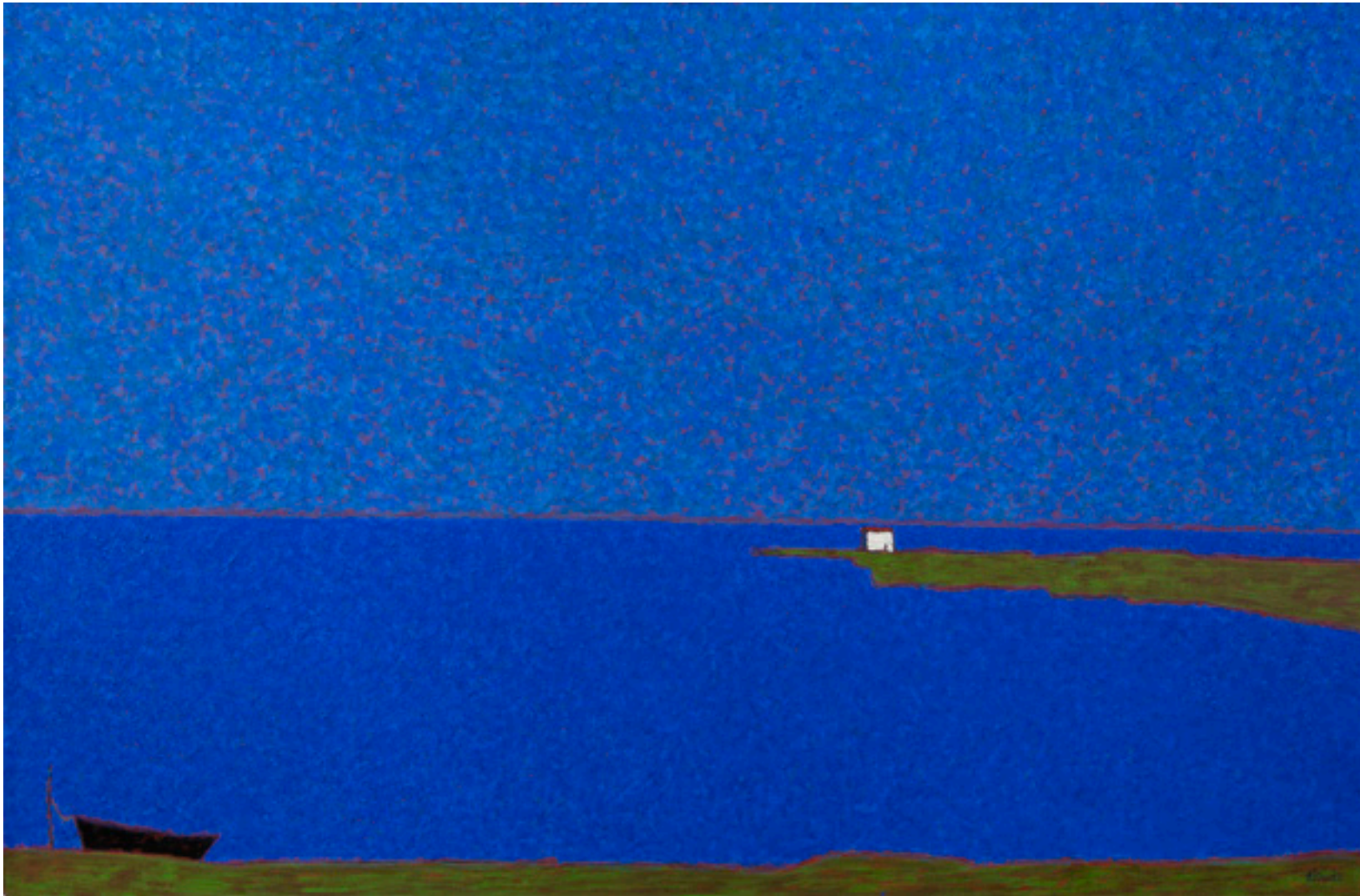
Vincent Bioulès L'Etang de l'or

Oil on canvas, 130x 195 cm/51 x 77 inch, 2021