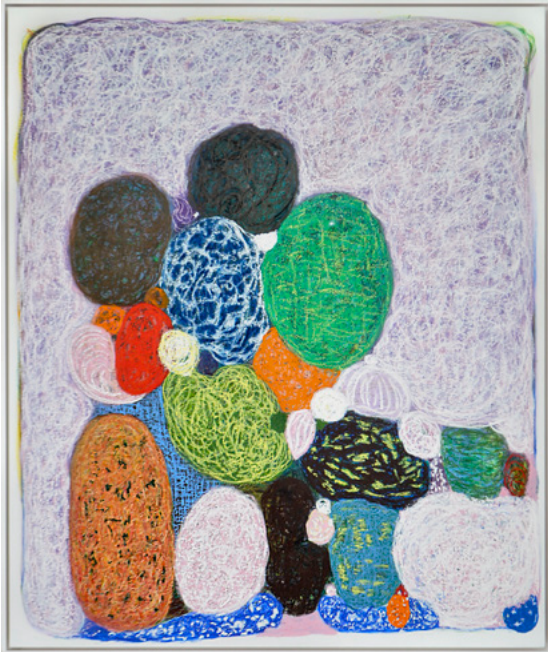
Jeff Kowatch She's dreaming

Oil on linen, 180 x 150 cm/71 x 59 inch, 2018