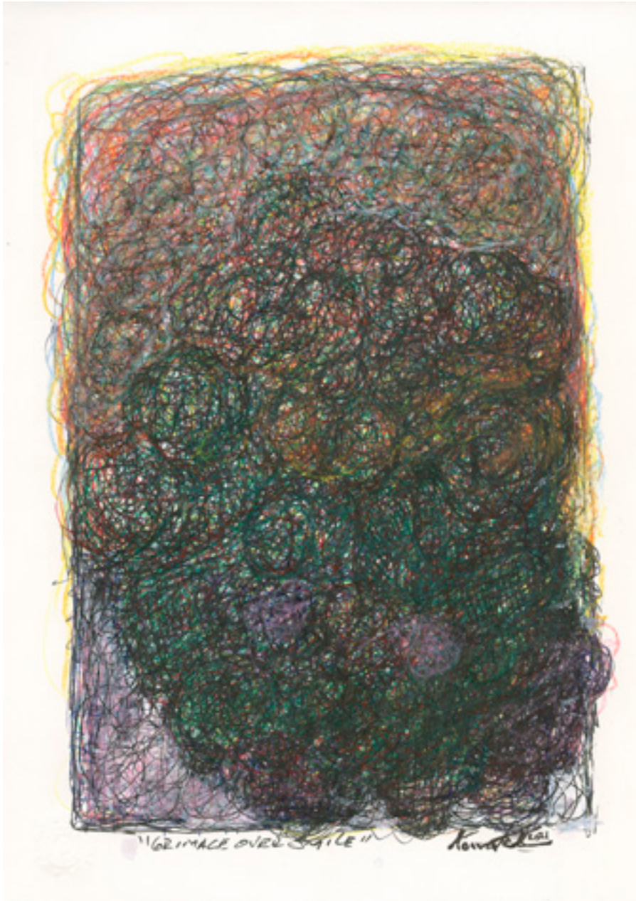
Jeff Kowatch Study grimace over smile #5

Ink and color pencil on paper, 29,7 x 21 cm/12 x 8 inch, 2021