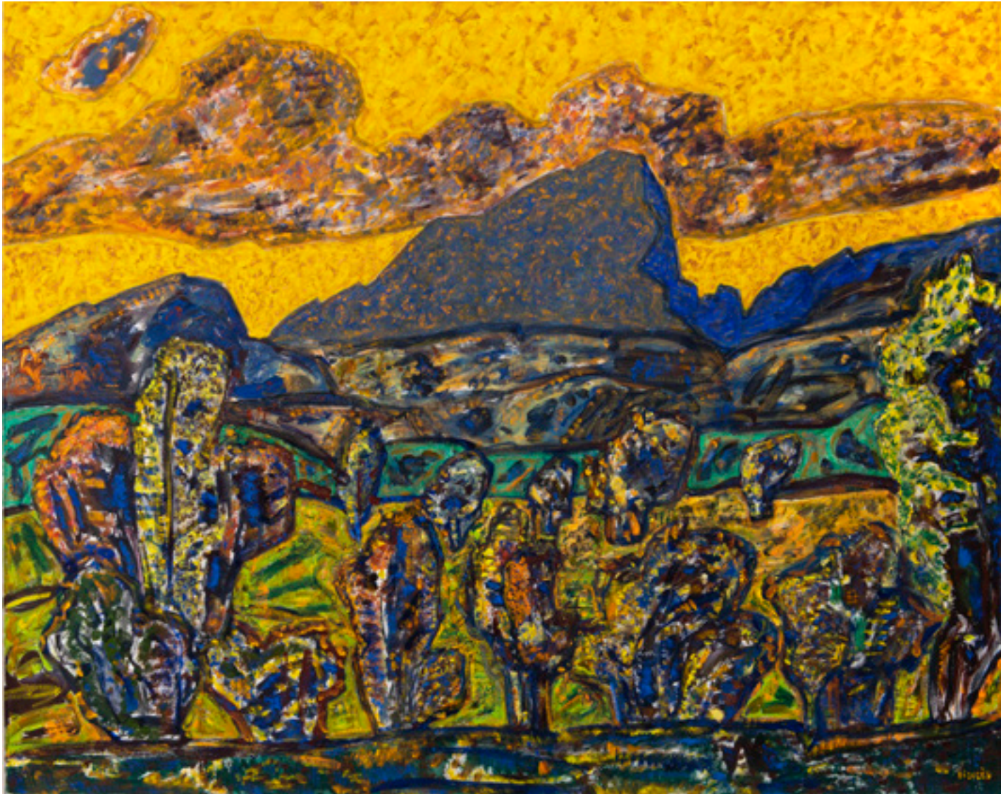
Vincent Bioulès L'Automne au Pic Saint Loup

Oil on canvas, 130 x 162 cm/51 x 64 inch, 2021