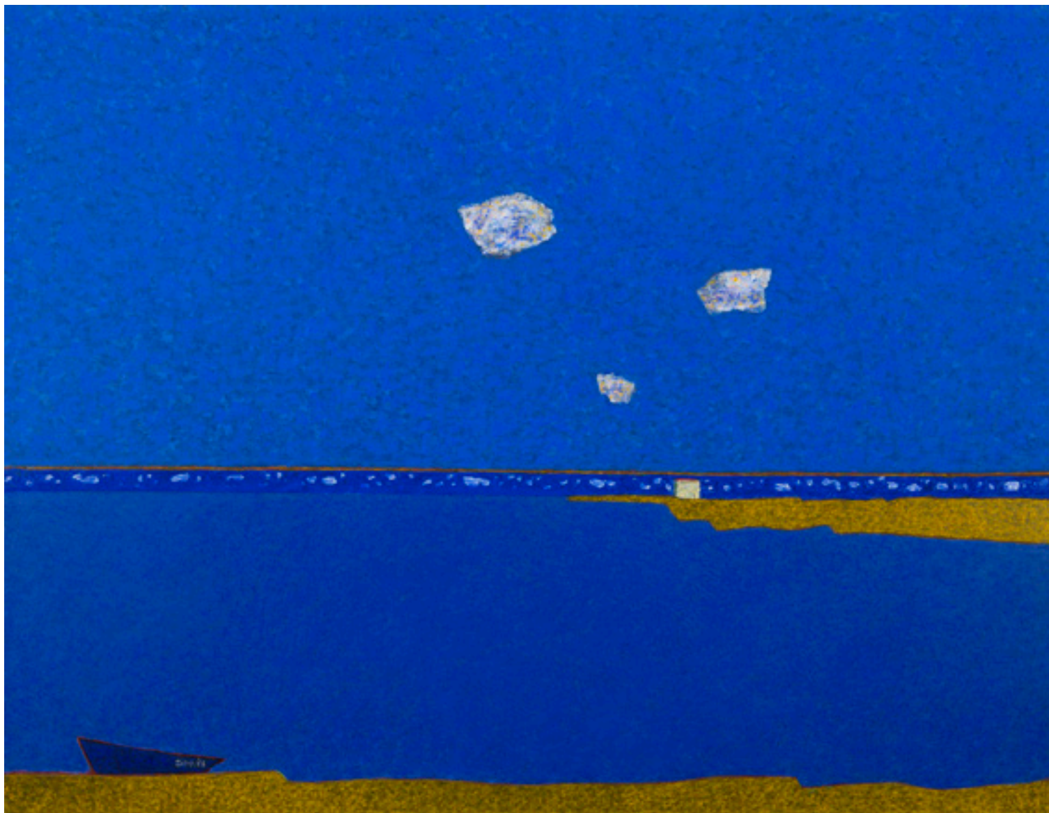
Vincent Bioulès Le Mistral se lève

Oil on canvas,, 130 x 162 cm/51 x 64 inch, 2022