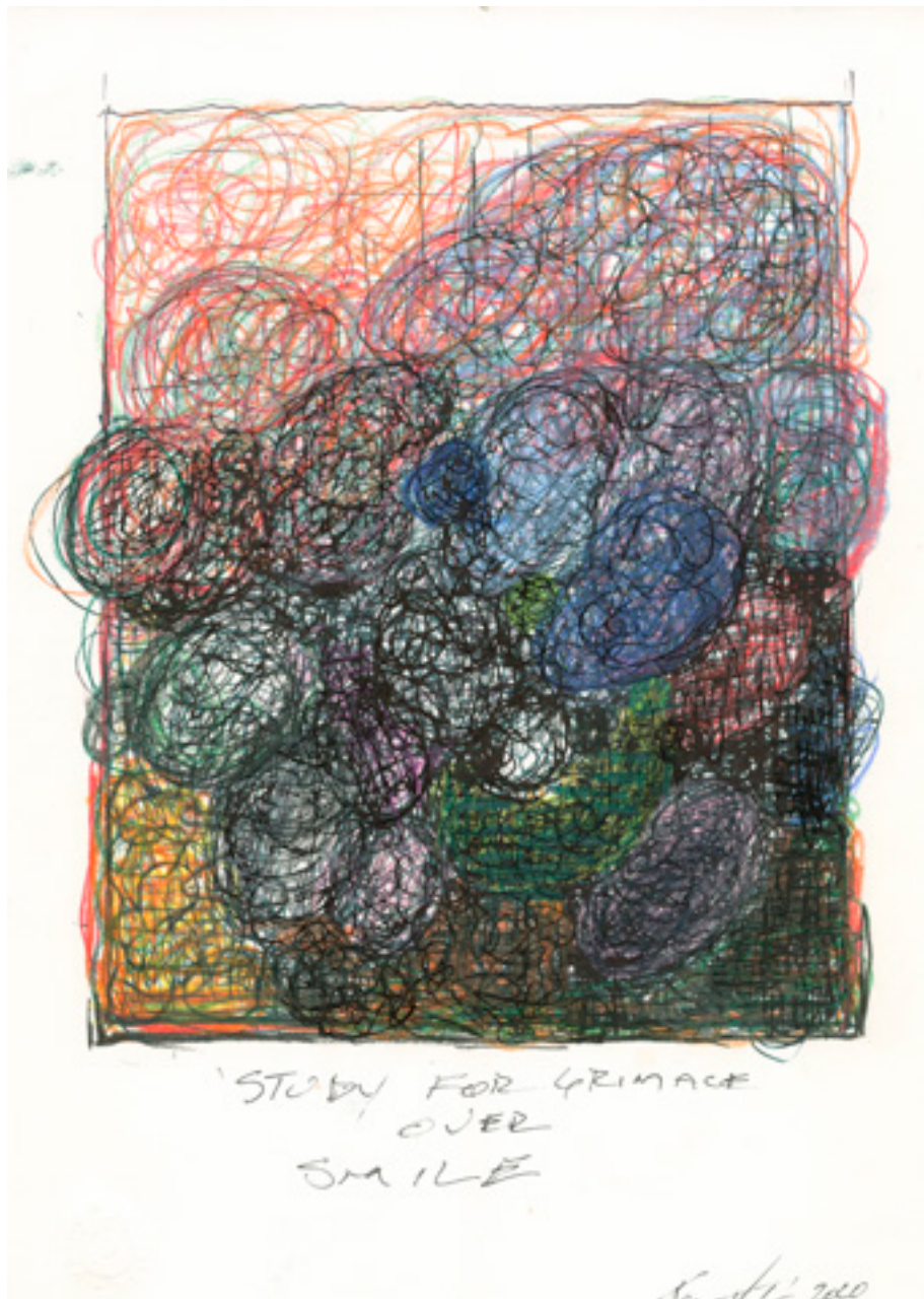
Jeff Kowatch Study grimace over smile #1

Ink and color pencil on paper, 29,7 x 21 cm/12 x 8 inch, 2021