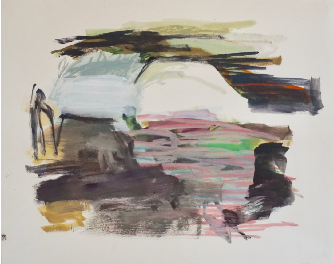
Herta MÜLLER 7/18, 2018 Huile sur papier, 50 x 65 cm