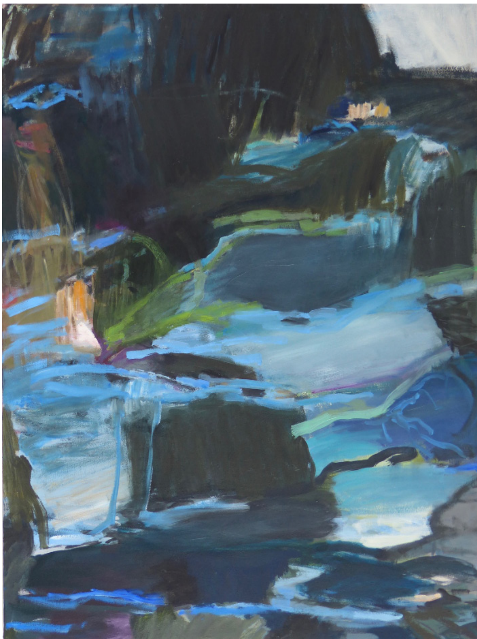
Herta MÜLLER, blaues Licht , 2015, Huile sur toile, 100 x 90 cm