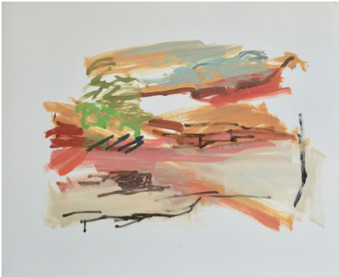
Herta MÜLLER 2/18, 2018 Huile sur papier, 50 x 65 cm