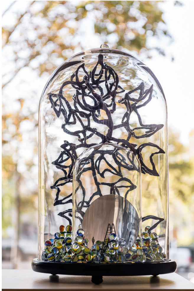
Tinka Pittoors, Globe allégorie vide , mixed media, 54 x 32 x 32 cm, 2018

Yolande De Bontridder , curator of Tinka Pittoors' exhibition -