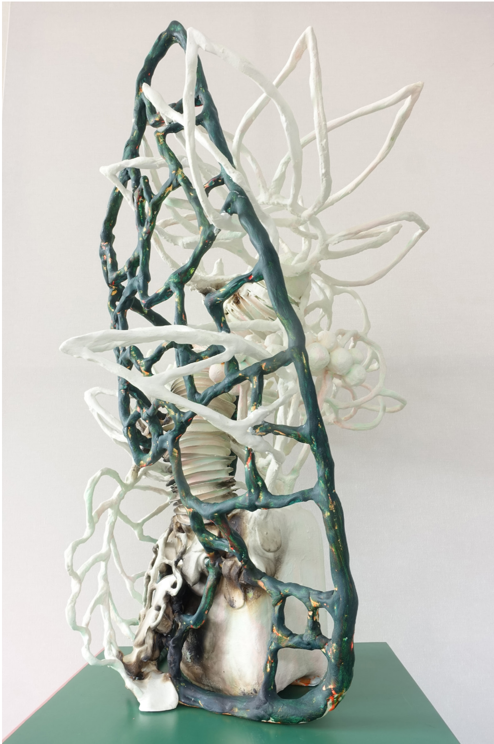
Tinka Pittoors, Giroflées, mixed media, 93 x 70 x 70 cm, 2018

Contact press : Evelyn Gessler evelyn.gessler@deciders.eu +32475235392