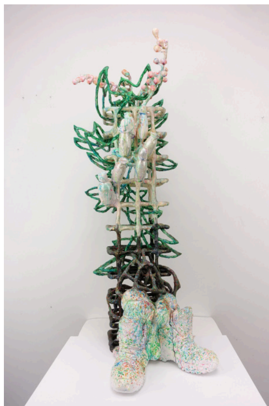
Daphne hedera epoxy, pigments, paint, varnish, iron, shoes 120 x 70 x 50 cm 2019

For Brussels Gallery Week-end 2019, she takes over the scenic space of the gallery, putting its walls down on the floor to create a surprising scenography and journey through her recent works.