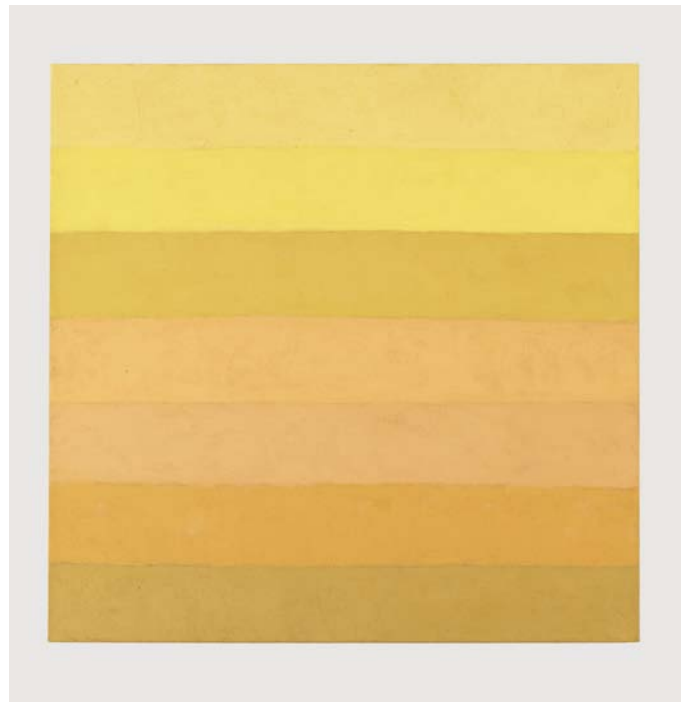
Merrill Wagner 7 Brands of Naples Yellow , 2009 Oil paint on linen 34 x 36 in