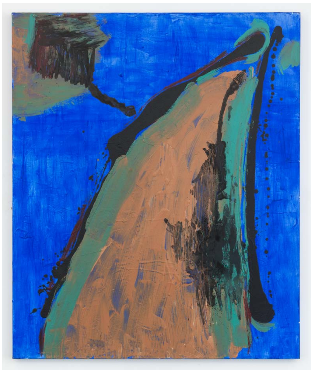
Regina Bogat, January, 1995, 1995 Acrylic on canvas 60 x 50 in

Regina BOGAT , au départ peintre « hard-edge » s'est employée dès 1964 à inclure des matériaux extra-picturaux comme des baguettes de bois peintes afin de diviser la couleur ou à appliquer des cordes sur la toile pour ajouter une qualité tri-dimensionnelle à sa peinture. Nous présentons ici quelques rares tableaux et œuvres sur papier des années 90 ainsi que des peintures de la série Palmyra (2013-2015) dont le sujet est la lumière avec le jeu abstrait des contrastes et des reflets qu'offrent les ruines de la « Venise syrienne des Sables ».