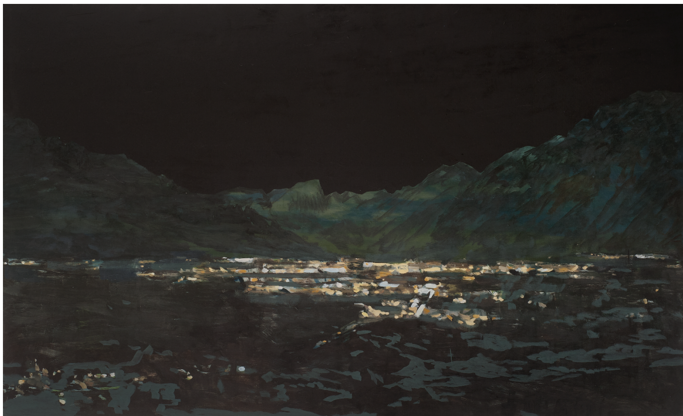
Arthur Aillaud, Untitled , Oil on canvas, 50 cm x 100 cm, 2016 Courtesy Galerie La Forest Divonne