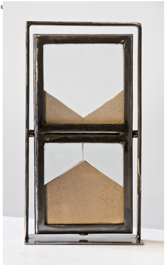
Jean-Bernard Métais, Acier, sable, verre , 17,5 x 10 cm, 2000. Courtesy Galerie La Forest Divonne